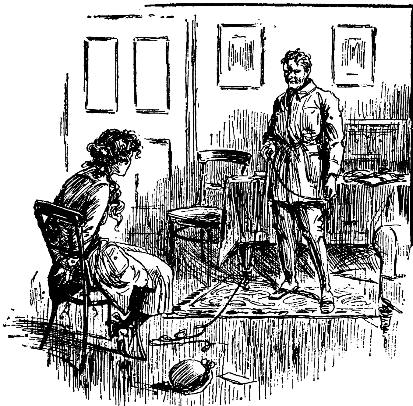
Bargrave produced a ball of stout cord, and prepared to tie the girl securely in a chair. She realised that resistance was useless. (See page 13.)

clean over the handle-bars into a heap upon a mass of thick bushes.